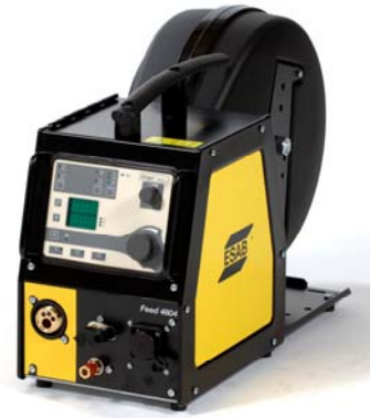
Origo™ Feed 4804