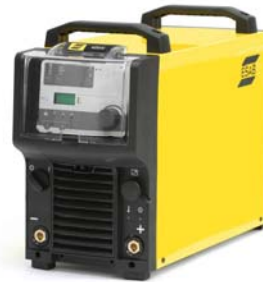
Origo™ Mig 4004i, A44

By choosing the MIG/MAG Arc Voltage Control setting you will achieve the best performance and avoiding arc out.