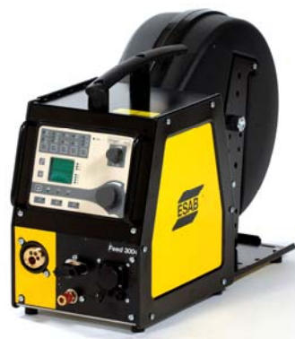
Origo™ Feed 3004