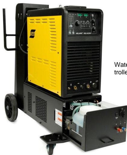
Water cooler fits into trolley compartment