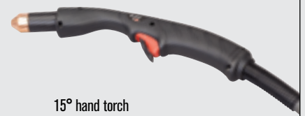
15° hand torch