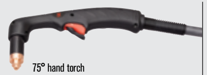
75° hand torch

(for more torch options, see www.hypertherm.com )